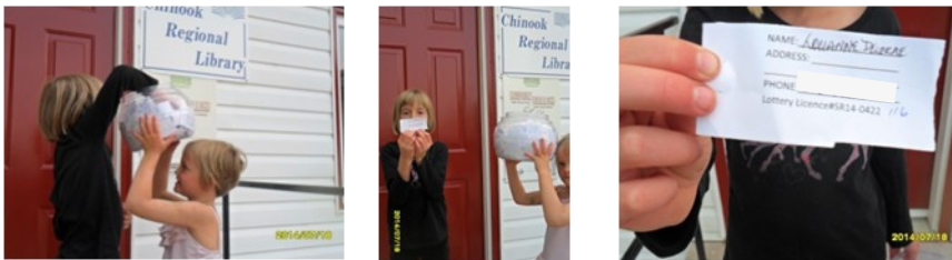
Draw held at the Chinook Regional Library on July 18